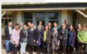
DOC NPS Consultation hui Palmerston North

Engagement in various spaces, that give effect to positive outcomes for our Iwi, continues to be an ongoing and time-consuming process. There are so many stakeholders that play a vital role in our journey to gaining positive and future focused outcomes that are vital to our Iwi. We have put in a lot of time, energy and commitment to enable positive 'value exchanges' and all of these relationships are as important as the next. To the key people of our regional and district councils, to central government agencies, to our local and regional community leaders we thank you immensely for your input into our year. However, nothing is more important to Ngāti Hauiti than the bond we hold with our iwi partners. We value these the most and to all the iwi leaders of Te Ranga Tupua, Mōkai Pātea and the staff that support these areas, we thank you all for the strength and unity that keeps us together as a strong force for the future.