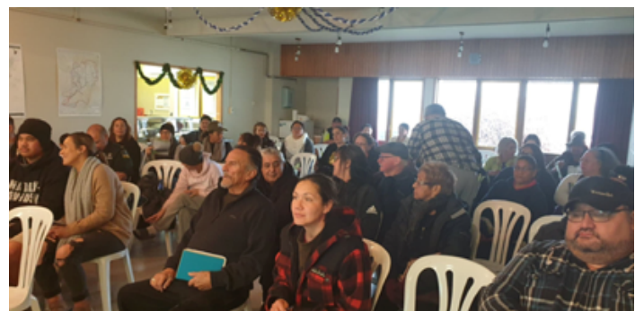
Taihape Mandate Hui

From June 10th through to July 8th, the Mōkai Pātea Waitangi Claims Trust (MPWCT) called upon Ngā Iwi Nui Tonu o Mōkai Pātea, to 'stand up and be counted', by voting for the MPWCT draft Deed of Mandate. Voting packs were mailed out to every 18+ registered Iwi member within the MPWCT confederation, inclusive of Ngāti Hauiti, Ngāi Te Ohuake, Ngāti Tamakopiri and Ngāti Whitikaupeka. Six Mandate Voting Hui across the motu were also held (within a 3 week timeframe) for whānau to register, vote as well as tautoko the Mōkai Pātea Waitangi Claims Trustees. Below are some pictures from the Taihape voting hui. I also attended the Tokaanu and Taradale Hui.