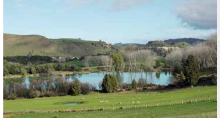
View over Lake Oporoa from a terrace north-east of the lake

On Friday 7 June 2019, Ngā Puna Rau o Rangitikei iwi reps and members of the Lakes380 project team 1 travelled to Lake Oporoa in the central Rangitikei catchment.