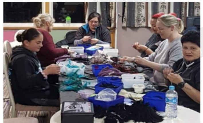
Korowai Class at Utiku