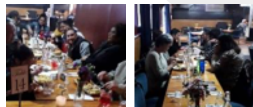
Hauiti Dinners at Taihape

On 25th October we held our Taihape Hauiti Dinner, which is usually held at the end of July. We had an awesome attendance of 24 whānau, who all took part and enjoyed our Hauiti Quiz. Unfortunately, I didn't manage to take any photos myself, so thank you to those who did.