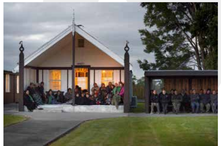
Rātā Marae at dawn during the Tomokanga unveiling

Ngā Pae o Te Māramatanga has awarded seed research funding to Whakauae and WAI Research, the research arm of Te Whānau o Waipareira Trust to together explore how whānau understand papakainga. The project is the second collaboration with Wai Research as part of our 2015 memorandum of understanding. Ngāti Hauti and Waipareira whānau will be invited to take part in the study which is known as Perceptions of Papakainga: An examination of home and how to cater services for Māori.