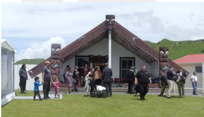
Week 12 Hearing at Moawhango Marae