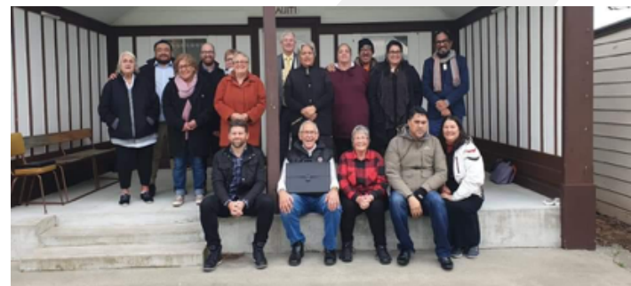
Council Members, Architects and Rata Marae whānau, following Presentation Ceremony